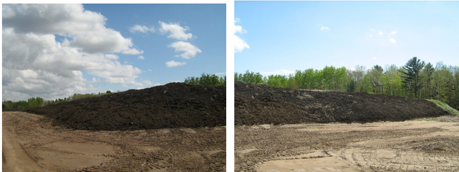
Figure 1 – Enfoui-Bec Inc.'s composting installation

In the EPA methodology, emission factors for Yard Trimmings are recommended to be used, yard trimmings being considered as surrogates for organic (type unknown) material in general 4 . For Enfoui-Bec Inc.'s composting project, the pastes and paper slime is an organic material.